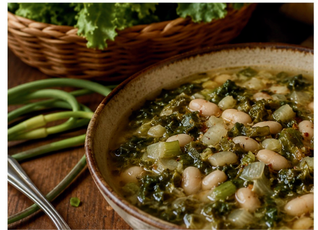
Alstede Farms Hometown Farm, Global Roots